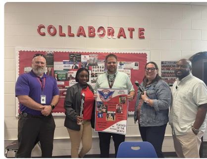
Stassi the Weapon Detection Dog made a visit!