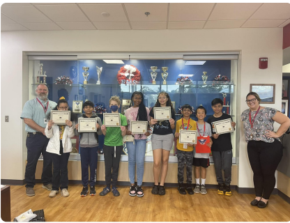
Stassi the Weapon Detection Dog made a visit!