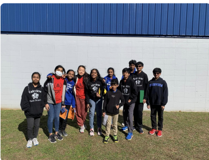
Congrats to our Math Comp students!