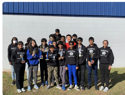
Congrats to our Math Comp students!