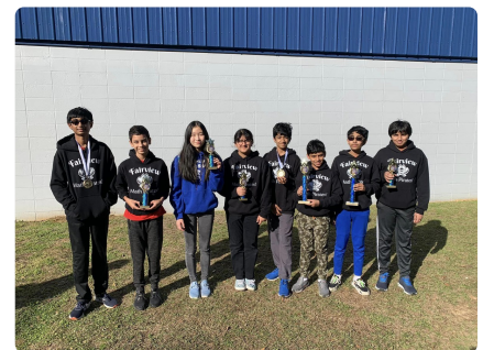
Congrats to our Math Comp students!